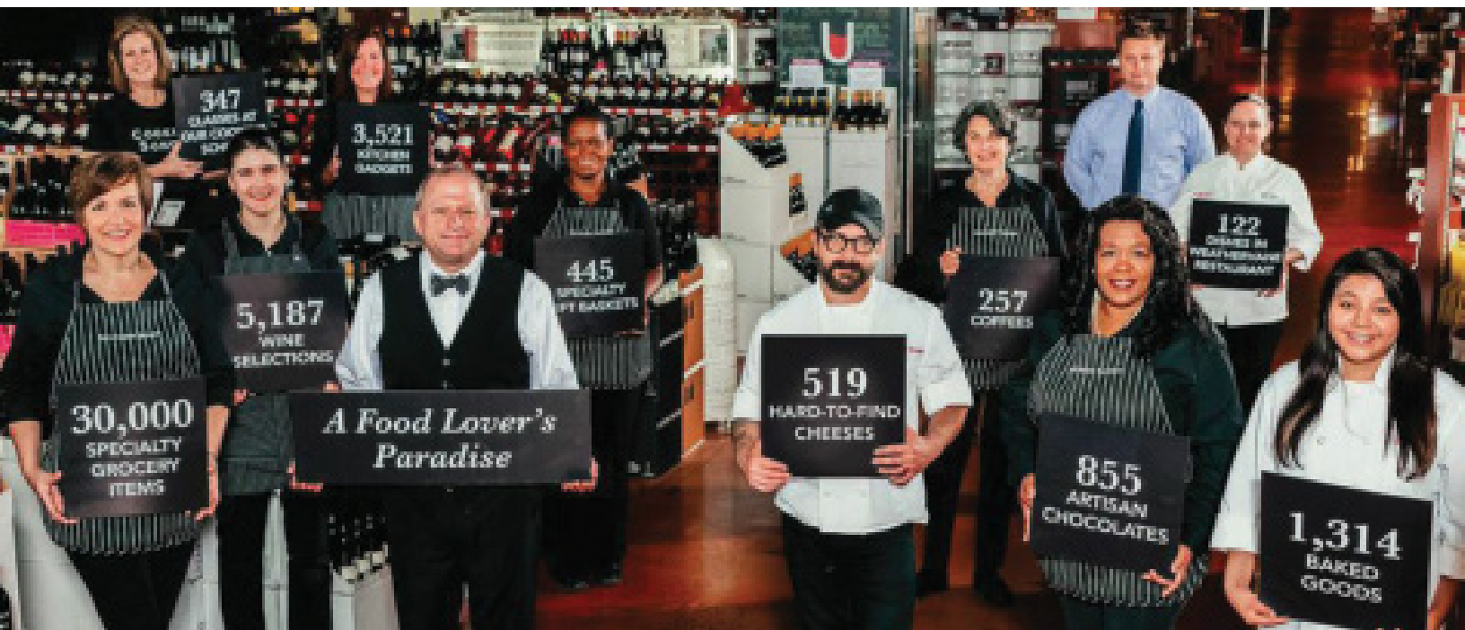
Southern Season, as seen in The Scout Guide.

Food lovers rejoice. Southern Season is a gourmet emporium with an inspiring selection of specialty food, wines, cheese, coffees, teas, confections and cookware. Taste buds salute this 60,000 sq ft oasis attracting shoppers from all over